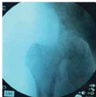
Fig. 2. Fracture reduction.

Follow-up was carried out at one week, one month, and 3 months (Fig. 4). The patient referred to a considerable improvement in pain (50%) in the immediate postoperative period, presenting maximum pain relief 3 days after the procedure (60%). In the assessment