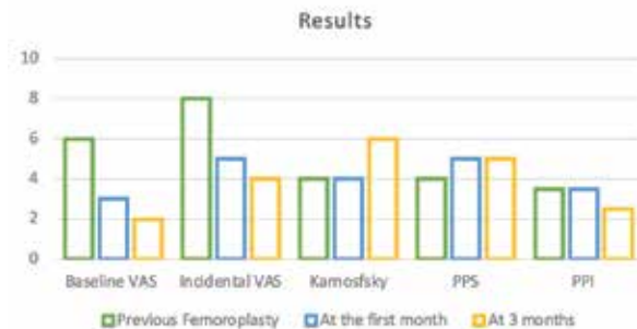
Fig. 4. Results of scales before femoroplasty and follow-up. Abbreviations: PPI, Palliative Prognostic Index; PPS, Palliative Performance Scale; VAS, Visual Analog Scale

Percutaneous bone cementation has been reported in different parts of the skeletal system, such as the tibia, pelvis, and various support points in the acetabulum, ilium, and sacrum, with approximately 90% pain relief